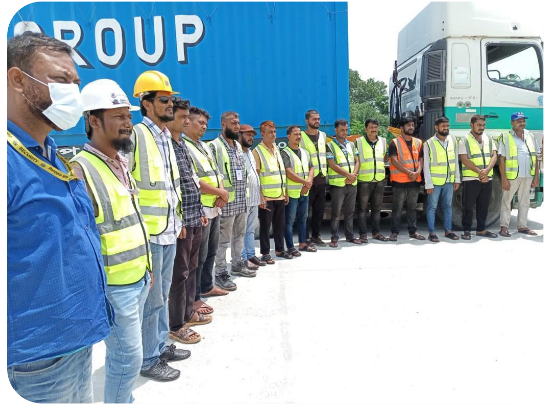
Shodesh Team for Nuclear Fuel Operation