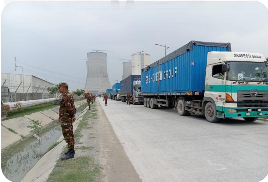
Nuclear fuel arrived at Nuclear Power Plant site in Rooppur amidst tight security