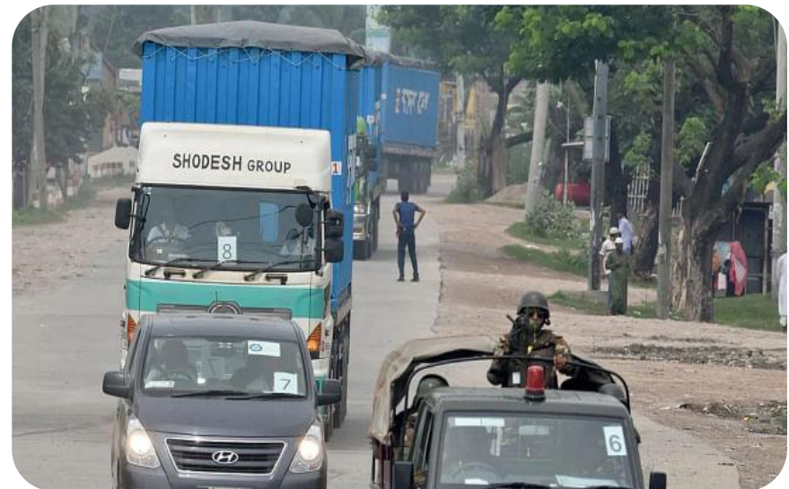
The fuel of first batch is being carried to the project site by our vehicles under special security arrangement