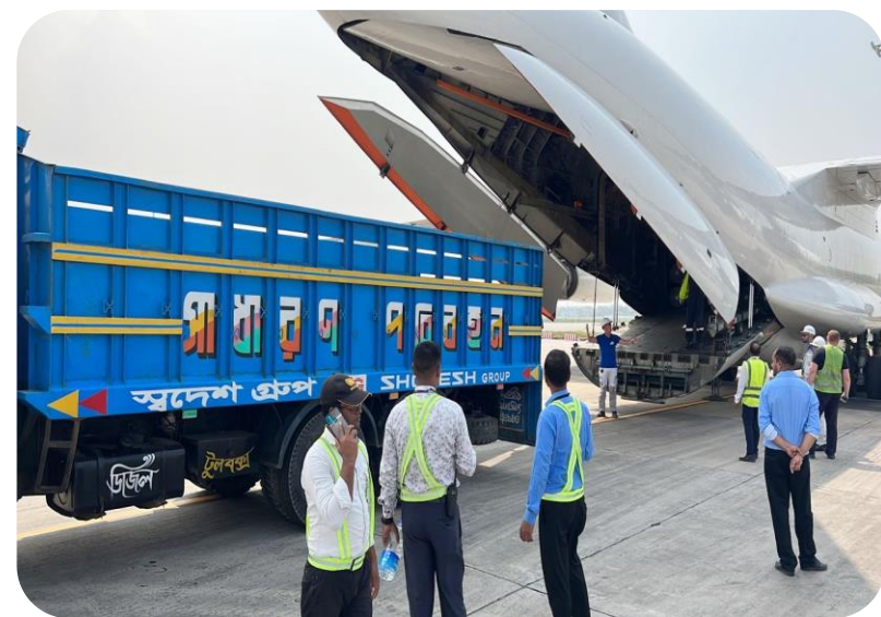
Loading Nuclear Fuel in to Vehicles from Aircrafts