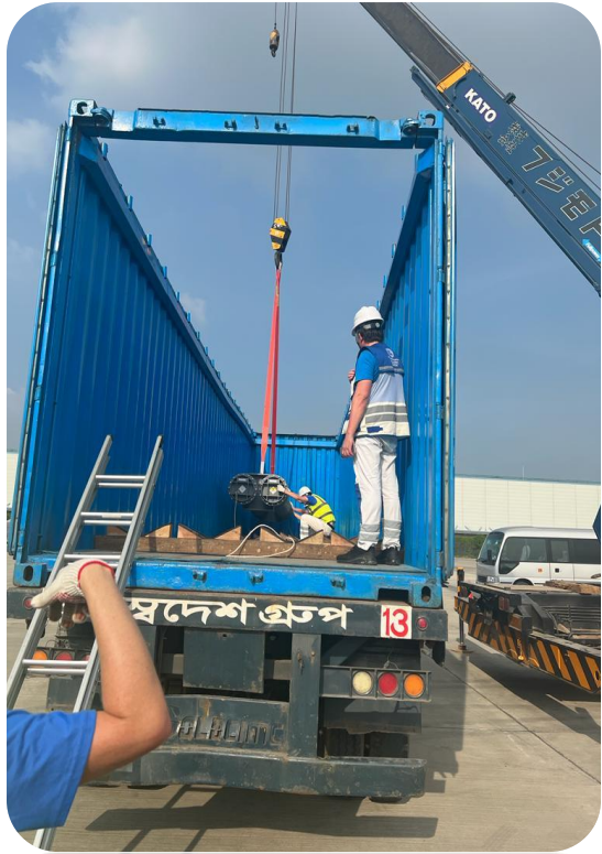
Unloading of Nuclear fuel at Jobsite