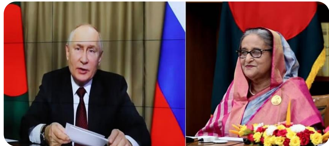
Bangladesh Prime Minister Hasina and Russian President Vladimir Putin virtually join function as Rooppur power plant receives nuclear fuel – Southeast Asia Journal

On 5 October, the certificate of safe handing over of fuel was officially given by the Russian fuel supplier to RNPP. With that Rooppur plant will achieve the status of a nuclear installation. Bangladesh became the 33rd member of the exclusive nuclear power elite club. Bangladesh Prime Minister Sheikh Hasina, President of the Russian Federation Vladimir Putin, and Director General of IAEA Rafael Mariano Grossi attended virtually connected to the ceremony.