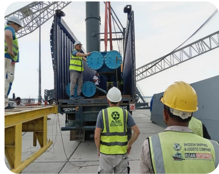
Unloading of Nuclear fuel at Jobsite