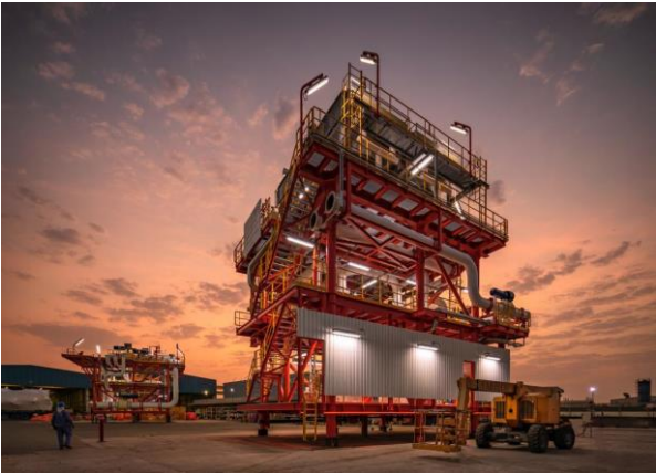
Photos of the modules